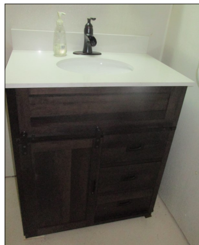
Tuesday's Work crew have installed new bathroom vanities