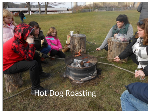
Hot Dog Roasting