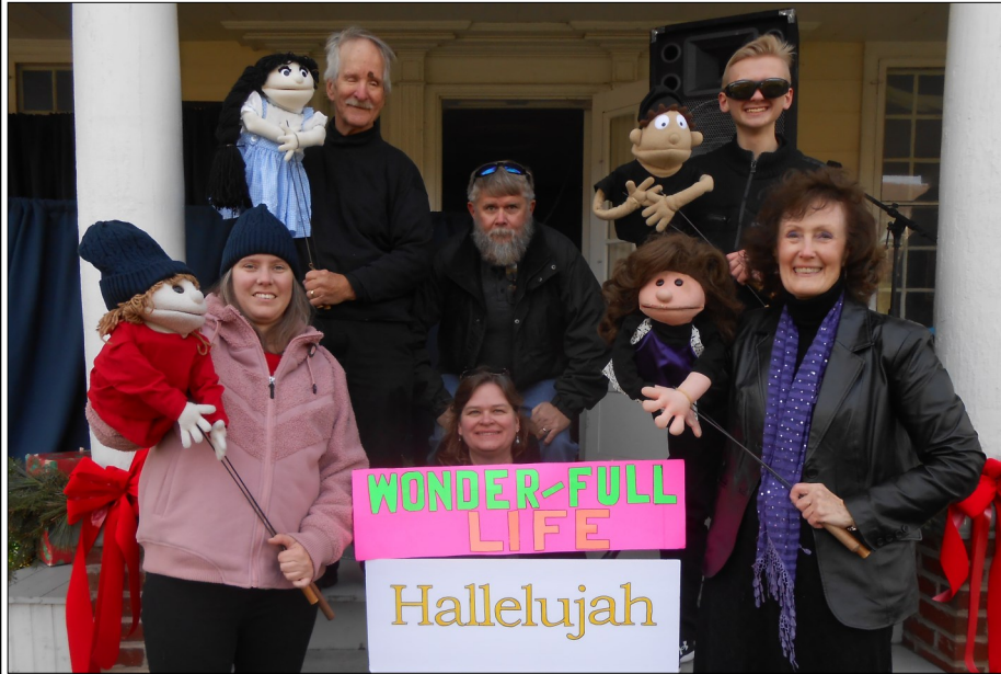
WONDER-FULL LIFE Hallelujah