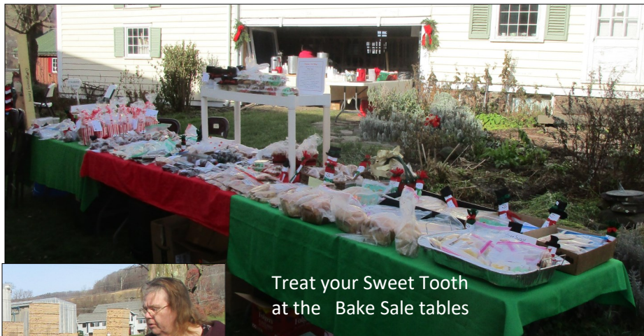
Treat your Sweet Tooth at the Bake Sale tables